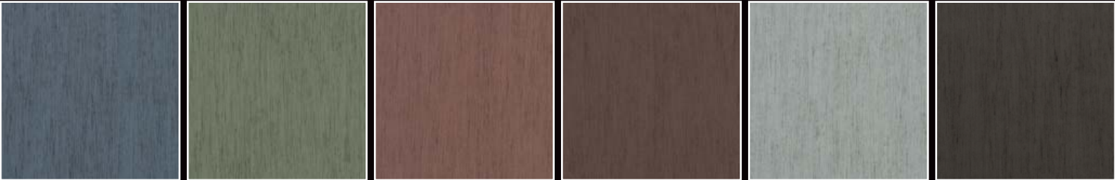
MEDITERRANEAN BLUE LAGOON GREEN ANTIQUE RED NATURAL EARTH BROWN ROCK GRAY GRAPHITE BLACK

Always attentive to new trends, Zintek has launched its own line of coloured laminates for use in the world of design: six colours which enhance the nature of zintek® zinc-titanium while maintaining its characteristics intact. Mediterranean Blue, Lagoon Green, Antique Red, Natural Earth Brown, Rock Grey and Graphite Black: when colour meets material and transforms into an actual architectural element. Ideal for covering solutions and façades, as well as for interior design, the zintek® coloured laminates instil character and originality in every design, in full harmony with the external environment.