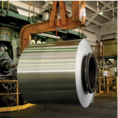
Semi-finished zintek® product from the rolling mill.