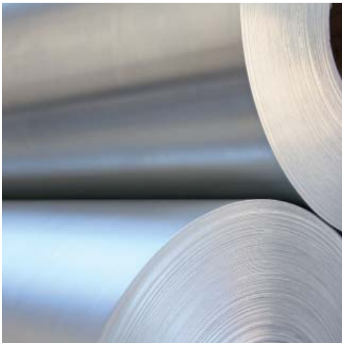
The rolling mill can produce zintek® in the form of wide strip rolls.