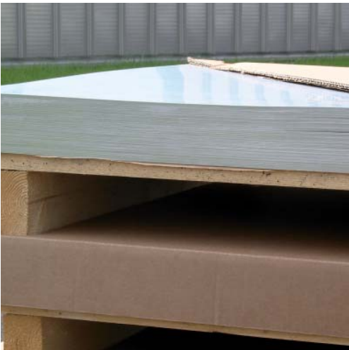
The rolling mill can produce zintek® in the form of sheets.