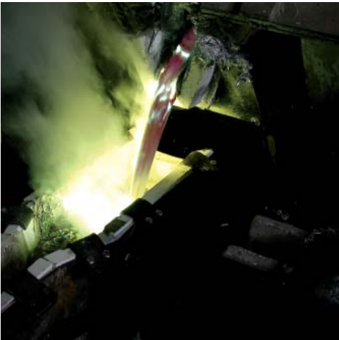
Smelting of the zinc with alloying elements (copper and titanium).