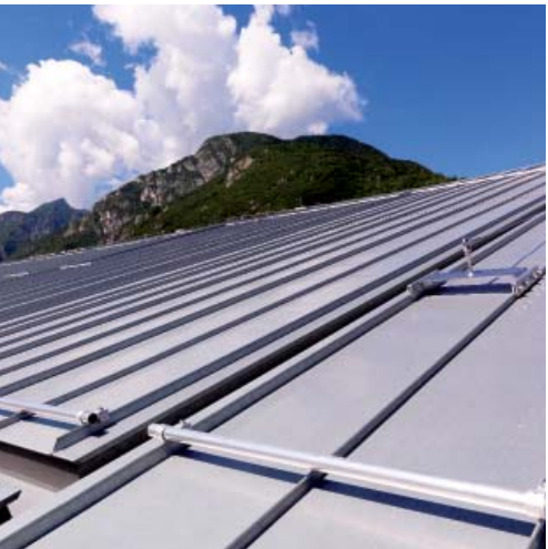
The natural installation use of zintek® is for covering solutions, façades and tinsmithery.

zintek® is a zinc, copper and titanium alloy, produced starting from 99,995 % quality zinc, in compliance with European Standard EN 1179, with the addition of alloying elements. zintek® is compliant with European Standard EN 988 - Zinc and zinc alloys. Specification for rolled flat products for building.