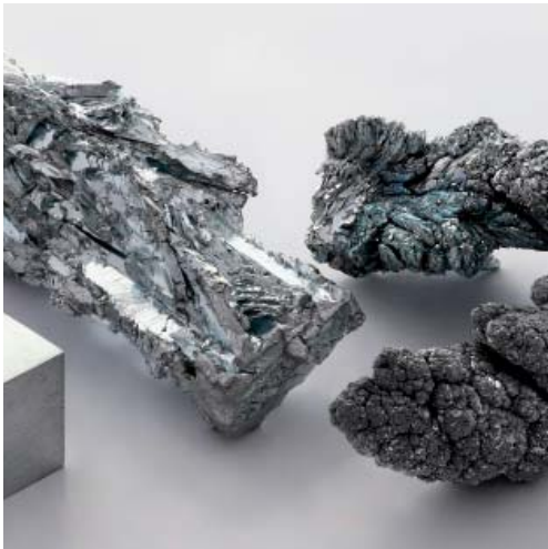
Zinc crystals from zinc compliant with European Standard EN 1179.